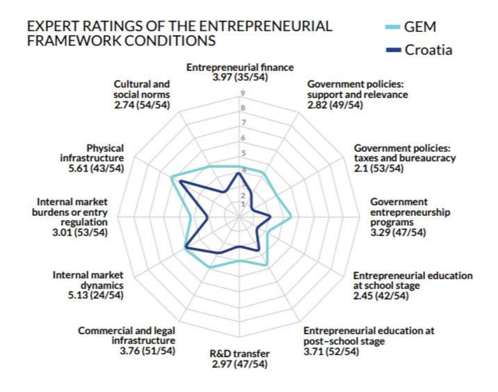
Figure 2. Expert rating of the entrepreneurial framework conditions for Croatia<sup>2</sup>

Population of Republic of Croatia in 2018 is 4.2 million. Annual GDP growth in 2017, % change is 2.8%. GGDP per Capita in 2017 international is 24.7 thousand $. When it comes to World Bank Ease of Doing Business Rating for 2018 Croatia scored 71.40/100 and was Ranked 58/190. According to World Bank Starting a Business Rating for 2018 Croatia gained 82.62/100 and was ranked 123/190. According to World Economic Forum Global Competitiveness for 2018, Croatia was ranked 68/140. According to World Economic Forum Income Group Average for 2018, Croatia has High Income Average.