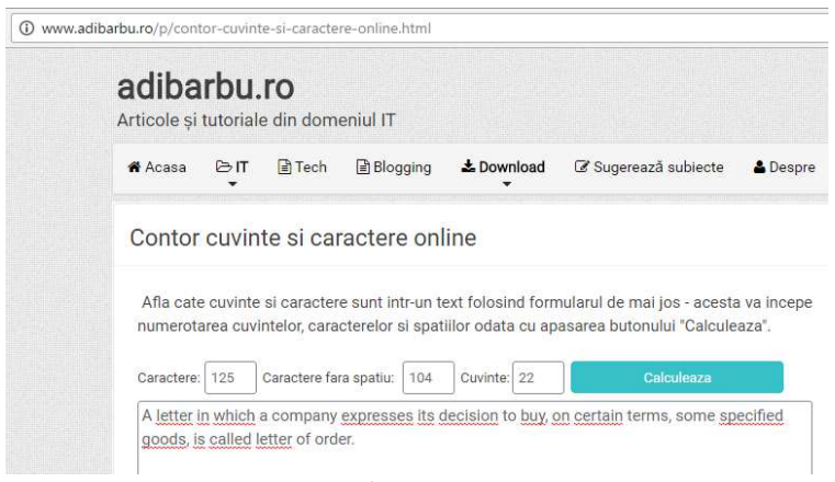
Fig. 1: Application for counting words in a text