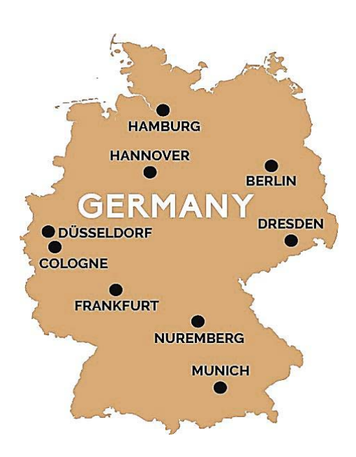
Figure 1: Map of Germany.

URL: <a href="http://jedep.spiruharet.ro">http://jedep.spiruharet.ro</a> e-mail: <a href="mailto:office_jedep@spiruharet.ro">office_jedep@spiruharet.ro</a>