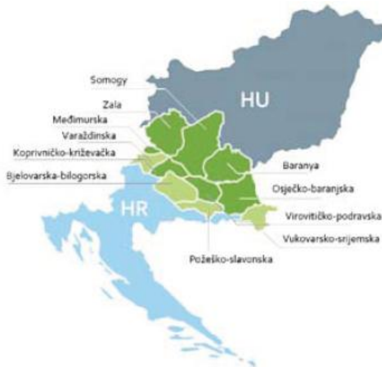
Fig.3. Cross-border areas of Figure Hungary and Croatia covered by the UNIREG IMPULSE project