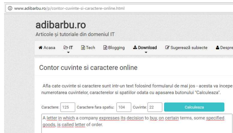
Fig. 1: Application for counting words in a text